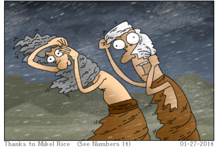
I BLAME THIS ON MANNA-MADE CLIMATE