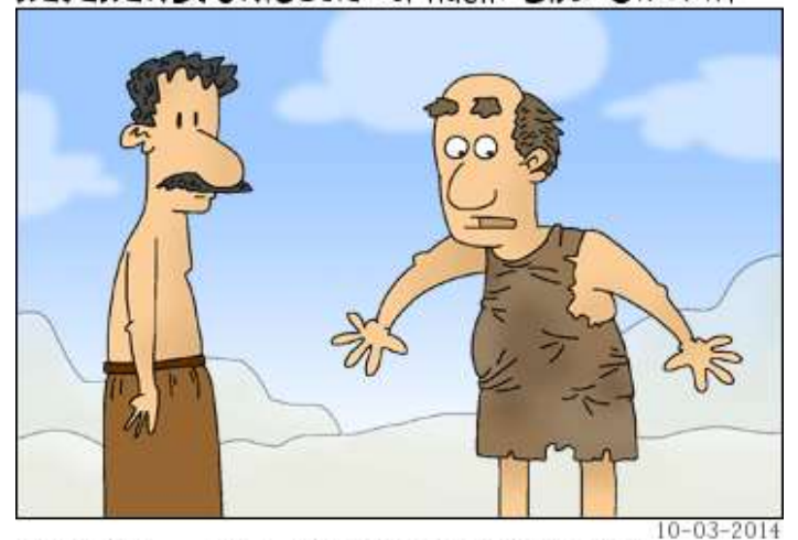
OH MAN ... THIS SACKCLOTH TOTALLY FIT ME THE LAST TIME I WORE IT