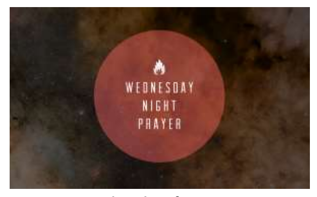
Join us on Wednesdays from 6:30 - 7:30 pm

email us at allthingsgoodchurch@gmail.org